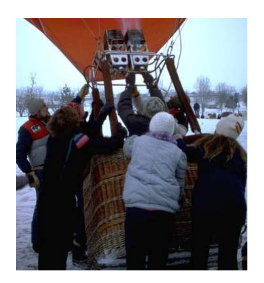
To warm up balloon passengers