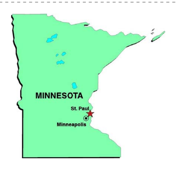
Living in Minnesota