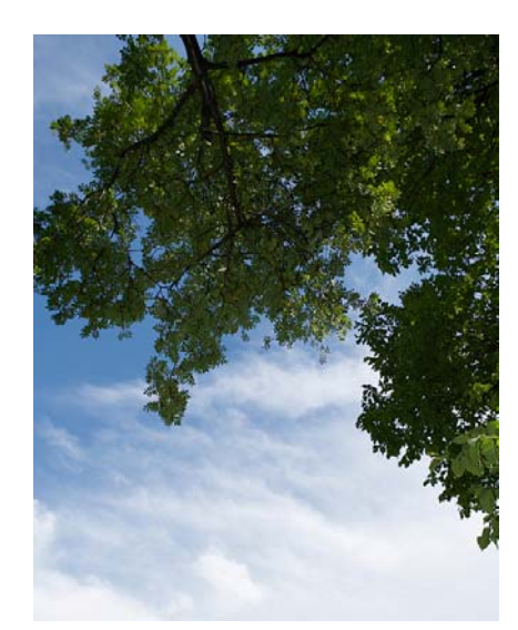
People can touch the treetops.