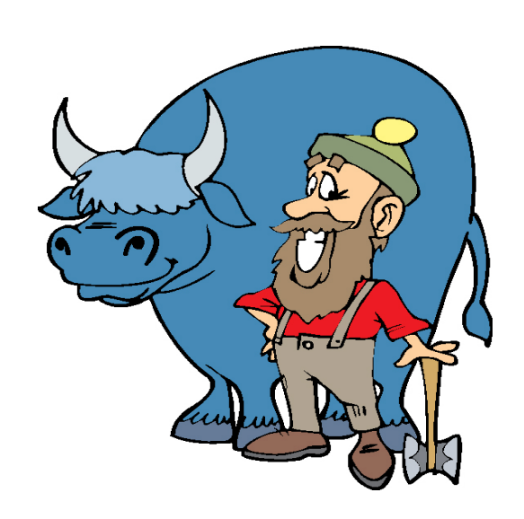
He had a giant blue ox.