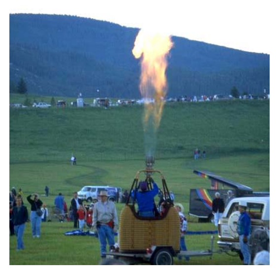
To provide light for the balloon ride