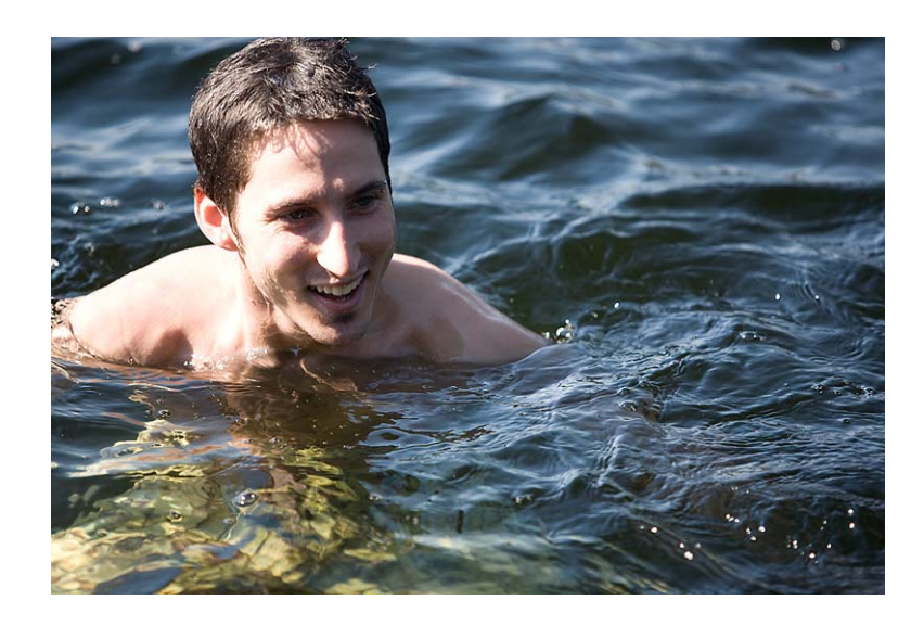
People can swim in the river.