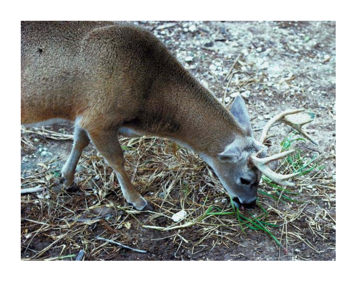
People can feed the deer.