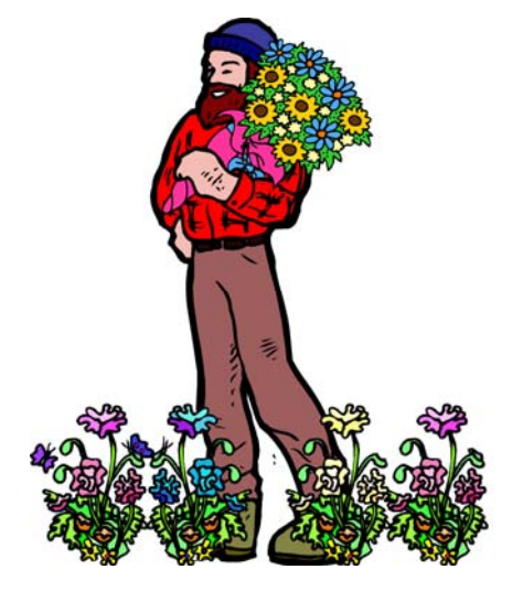
He planted flowers.