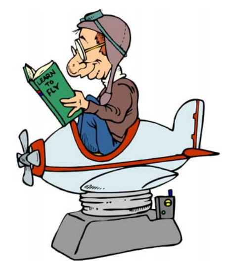
How to Be a Pilot