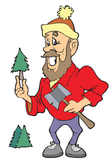
He picked up trees.